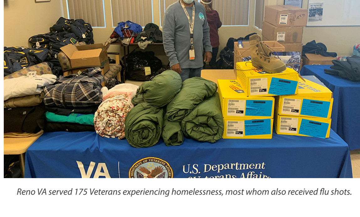
For 12 years, VA Sierra Nevada Health Care System in Reno has conducted its annual Homeless Veteran Stand Down. This year, months of planning proved challenging due to

the COVID-19 pandemic and natural disasters, but Reno VA overcame those challenges with innovation ultimately serving 175 Homeless Veterans, most whom also received flu