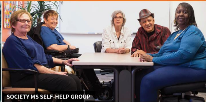
SOCIETY MS SELF-HELP GROUP