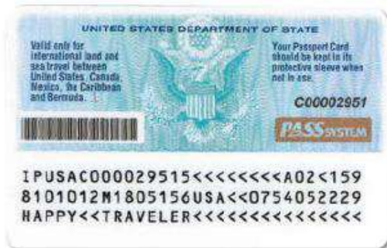
Passport Card front and back

The information contained in this document is proprietary and may not be transmitted or disclosed to anyone outside of the Government or authorized representatives without written permission.