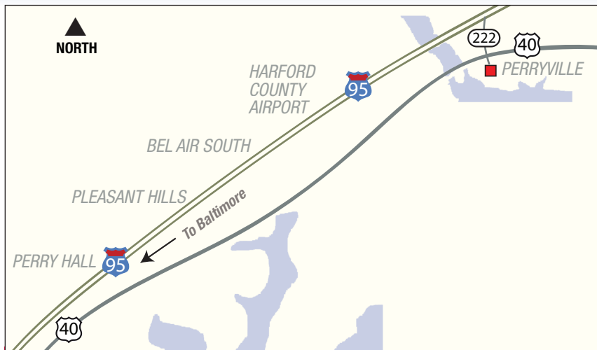
Perry Point VA Medical Center, Perry Point, MD 21902