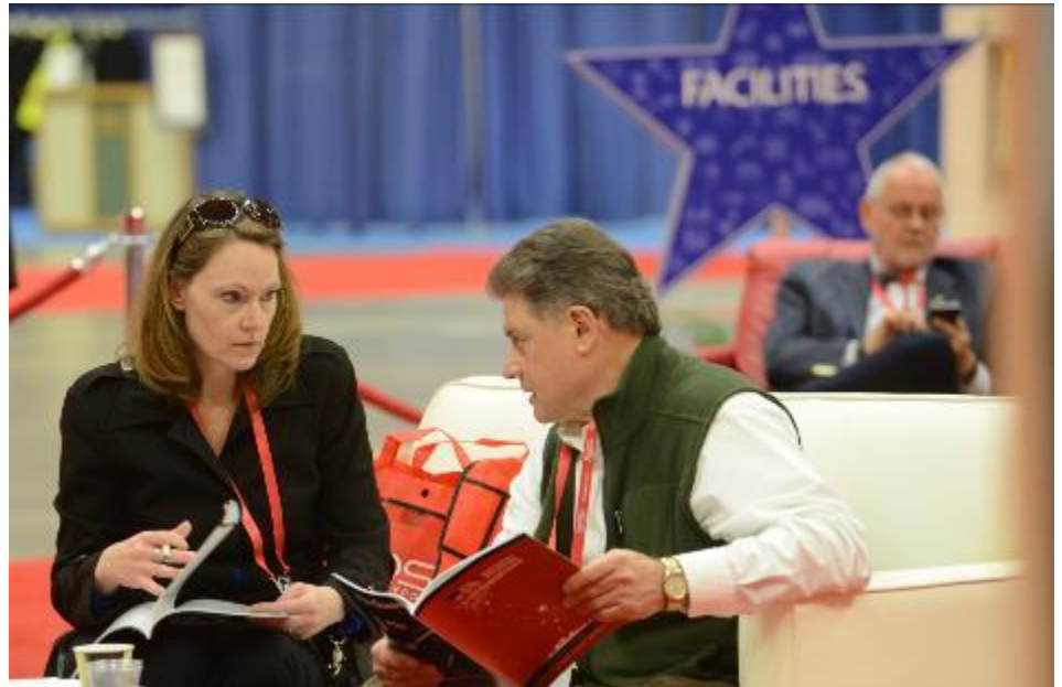
VOSBs engage, network, and access contracting opportunities at #NVSBE2016 in Minneapolis.

Veteran Small Business Owners Converge at National Procurement Event