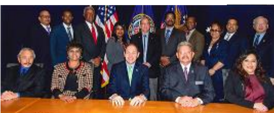
Advisory Committee on Minority Veterans December 6, 2016