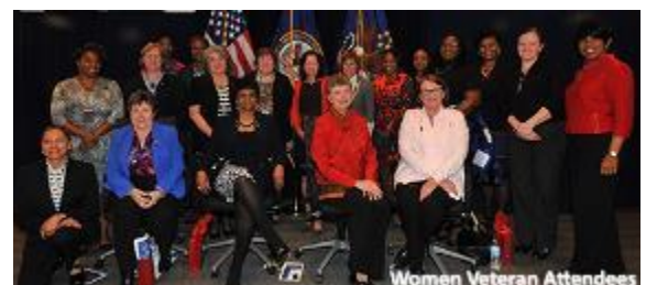
Women Veteran Attendees