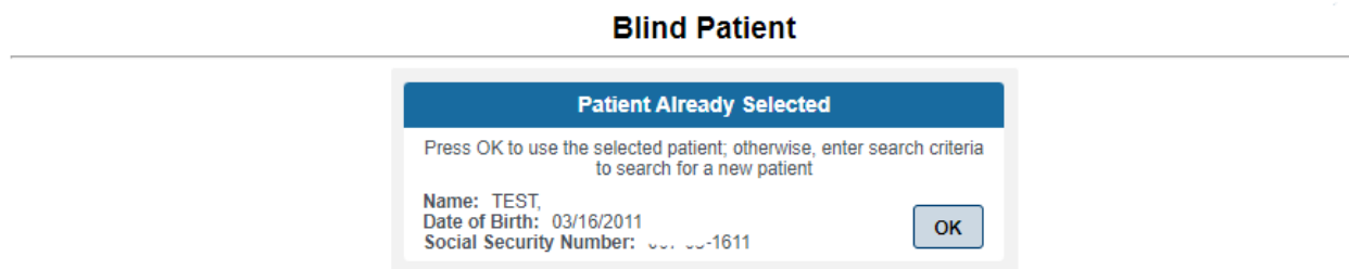
Figure 1 - Patient with last name only

Patient with a last name only is successfully enrolled and placed on the roster.