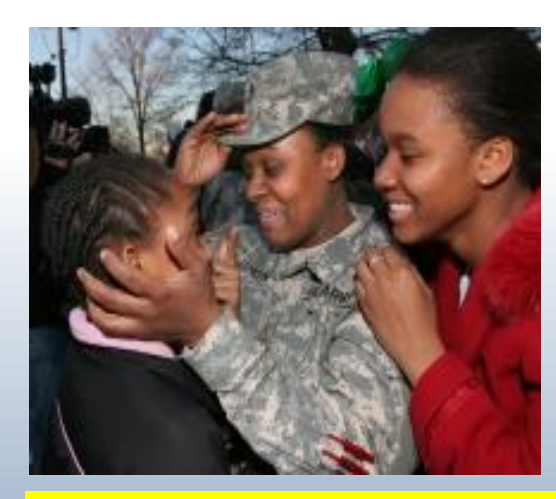
Welcome Home and Yellow Ribbon Event